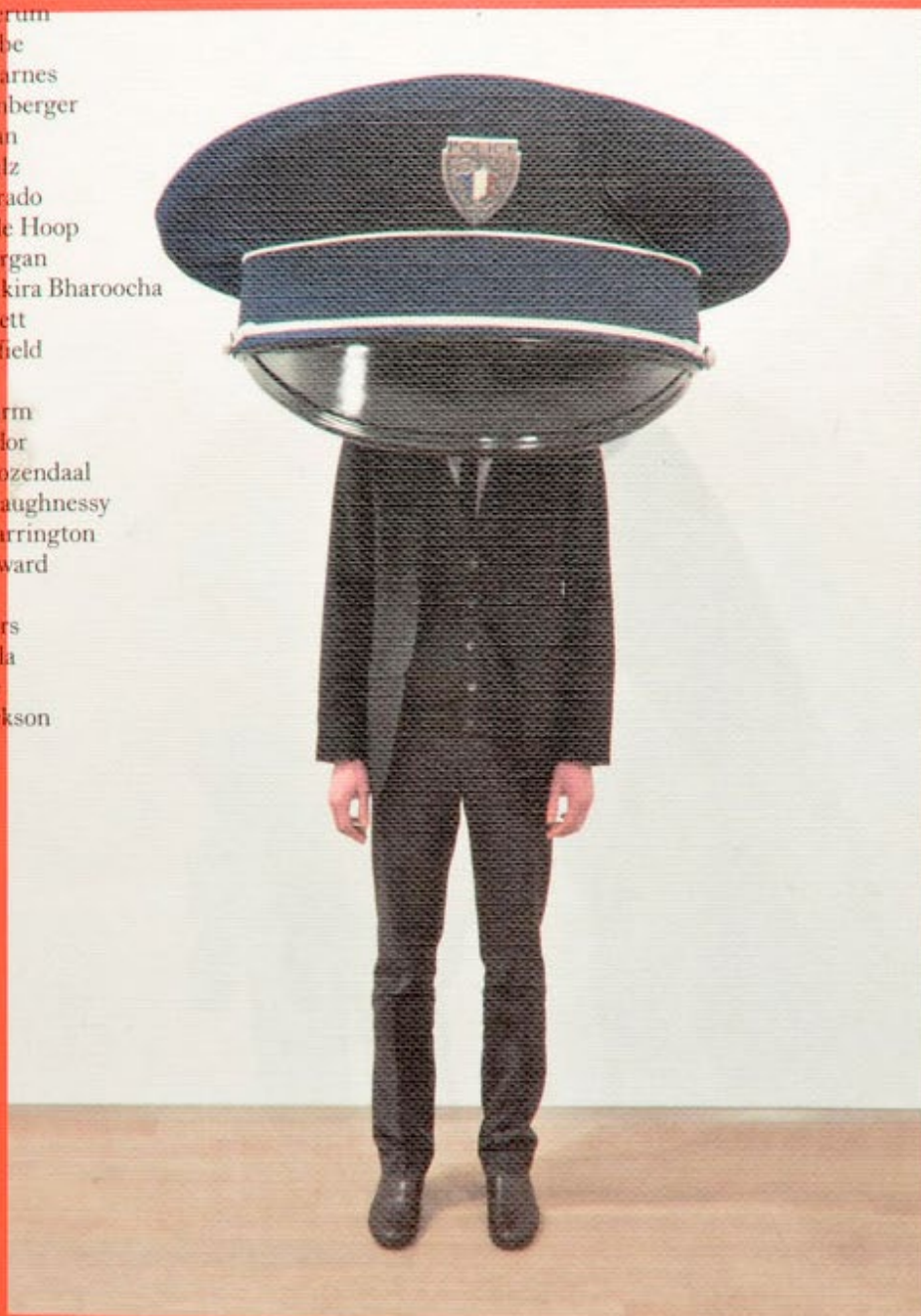
Erwin Wurm - French Police Cap, 2010